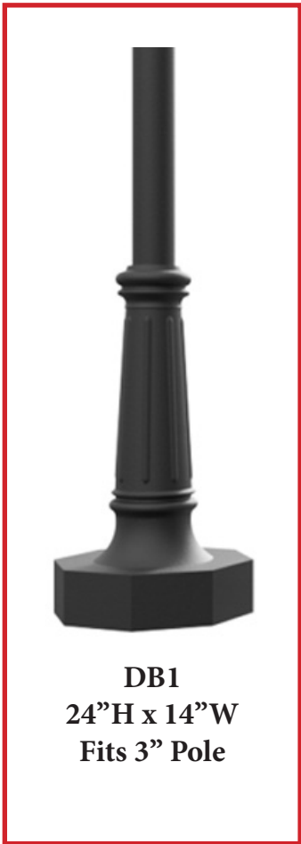
DB1 24"H x 14"W Fits 3" Pole