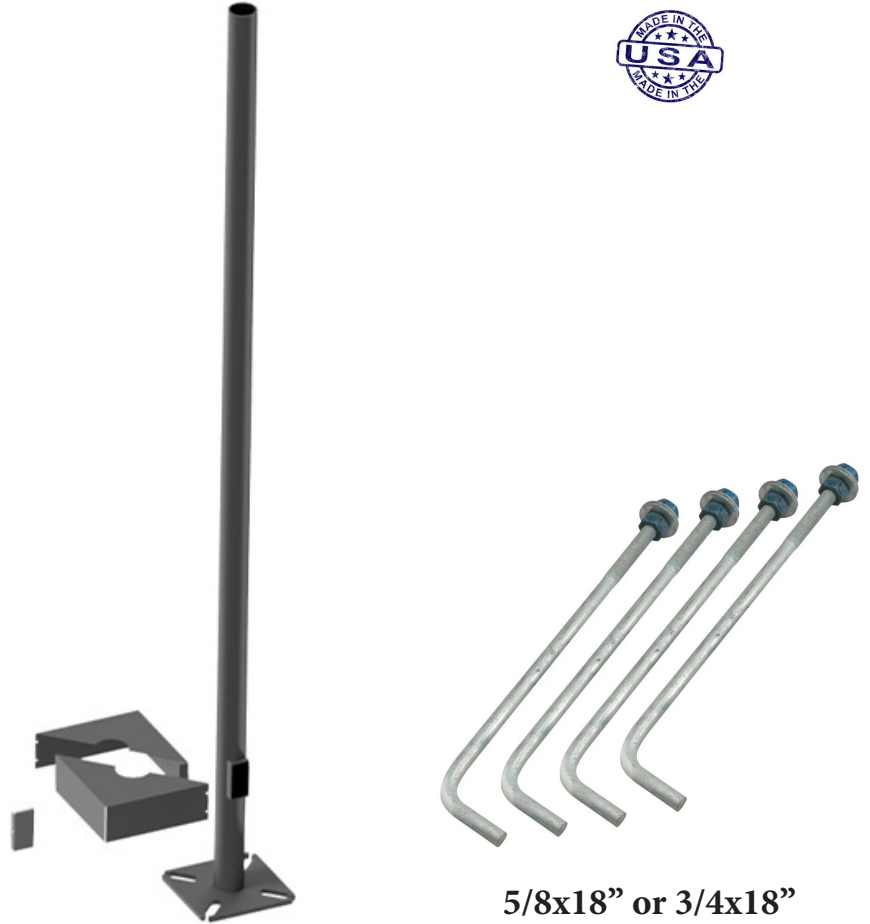
5/8x18" or 3/4x18"

Grounding hole provided inside hand hole.