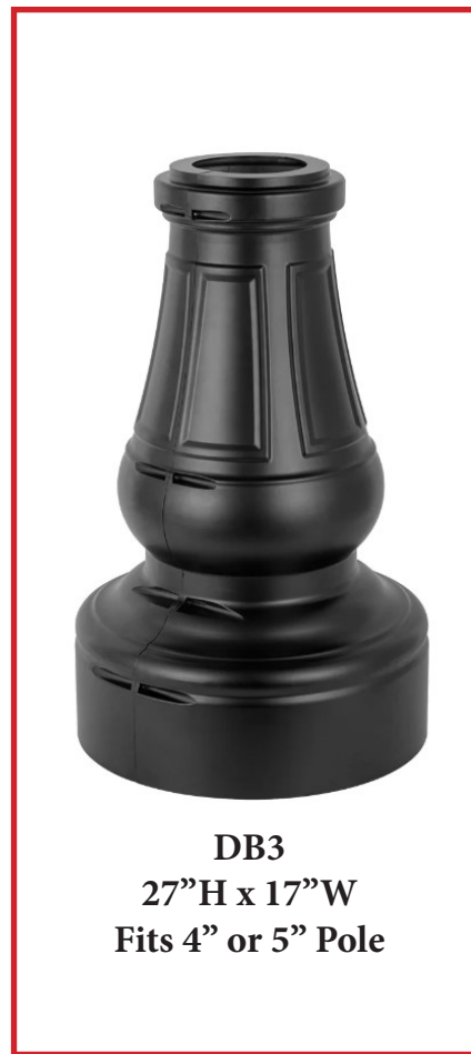
DB3 27"H x 17"W Fits 4" or 5" Pole