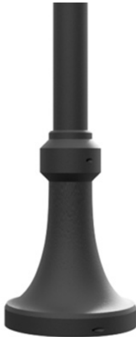
DB2 22"H x 15"W Fits 4" Pole