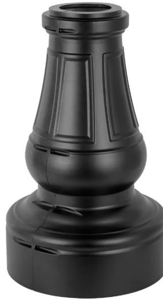
DB3 27"H x 17"W Fits 4" or 5" Pole