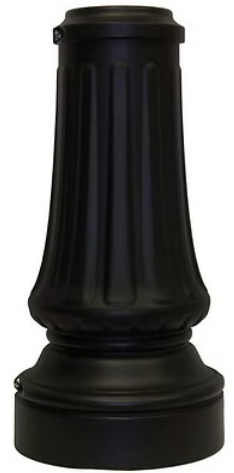
DB4 24"H x 12"W Fits 4" Pole