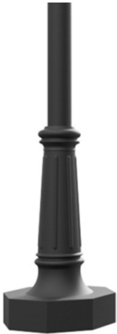
DB1 24"H x 14"W Fits 3" Pole