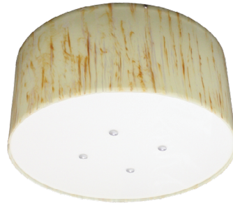
lens bottom w/ sterling onyx

Description: A Decorative Drum Style Pendant with Multiple Lens Options Materials: 20ga. G90 Galvanized Steel Finish: Powder Coated Lens: White Acrylic Standard & Other Options LED: Integrated LED Array Listing: Damp List to Meet UL1598 Standard Driver Info: 120V Installation Information: Install by Qualified Electrician Warranty: 2 Years From Date of Shipment