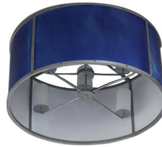
open bottom w/ lapis blue