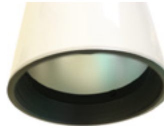
Shown w/ Black Baffle Option