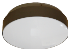
SB (steel) +.0359" to Dia.