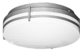
SBAR (steel) +.5" to Dia.