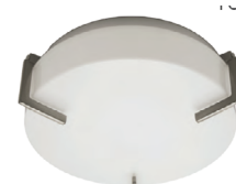
3F (alum) +5" to Dia. +5" to Ext.