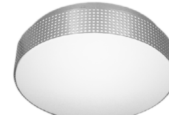
PERF (steel) +.0359" to Dia.