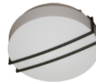
2BF (steel) +.5" to Dia. +.25" to Ext.