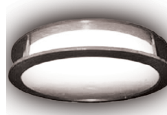
SR (alum) +1.5" to Dia.