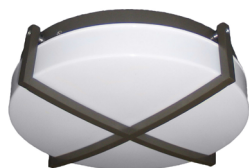
X-Bar (Alum) +.625" to Dia. & Ext.

Divine Lighting & Mfg., LLC. 3704 Hilltop Dr. Ste. 200