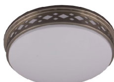
DB (steel) +.0359" to Dia.